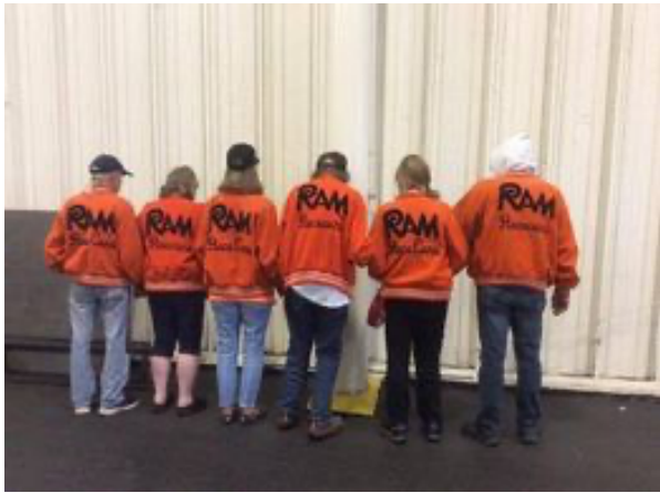
It's "The RAM" line up.