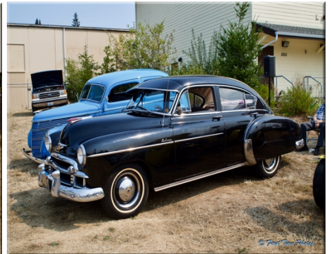
A nice pair of Oldies.