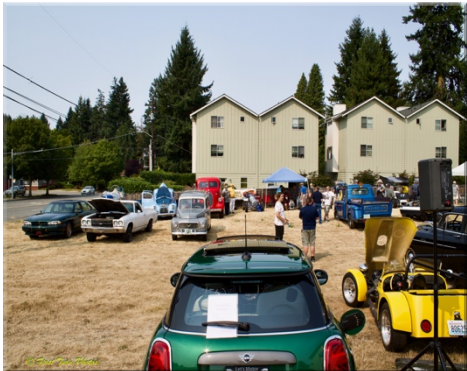
A variety of cars.

Since we haven't had any shows for almost 2 years, I am going to fill up a lot of this issue with photos from the Shoreline Historical Museum car show. We had a nice variety for such a short notice and there were several cars I missed as I was late getting there and didn't get any photos until an hour or more after it started. Sorry.