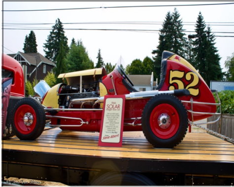
The #52 Solar