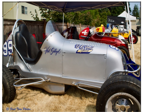
Hal's #99 Solar