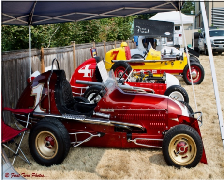
Dan Blair's #1.