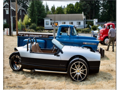
Another view of Kate.