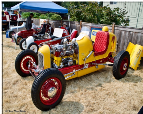
Another view of the SAMCO.