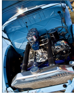
Warren's power plant.