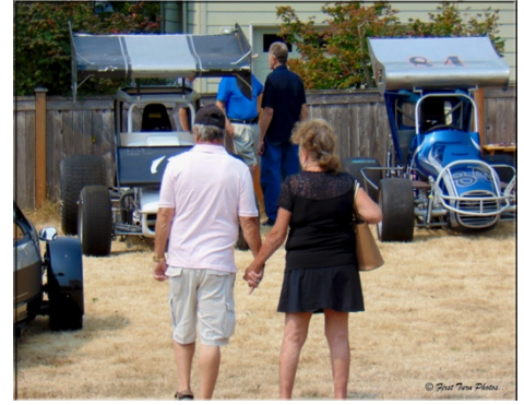
Just looking. Very nice mods.