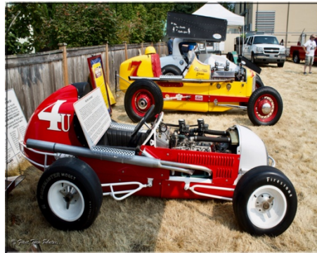
The Club Car #4u and it's Wood, Plastic & Metal motor.