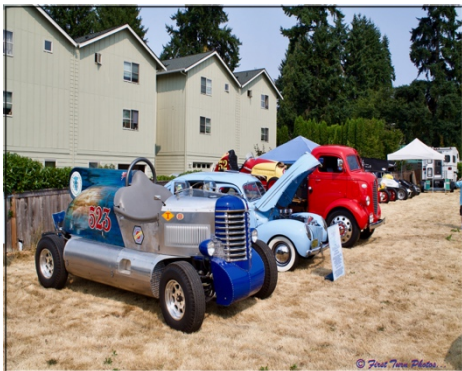
The Back Row