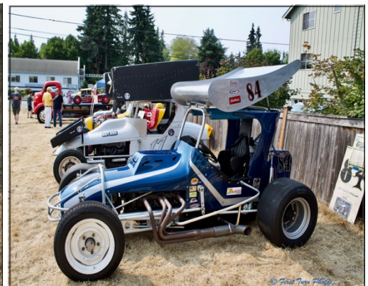
A look down the back fence line up.