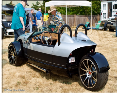
Kate, an interesting 3 wheeler.