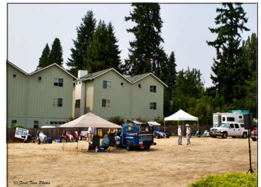
The shows over but we're still catching up.

We hope you enjoyed the photos and brought back some memories. Those that were there enjoyed being able to show their cars, catch up on what happened the last year and a half, meet new people and make some plans for the future. While the show was small compared to those in the past because of the short notice, the feeling was up beat and positive. Thanks to all that participated and we are looking forward to 2022.