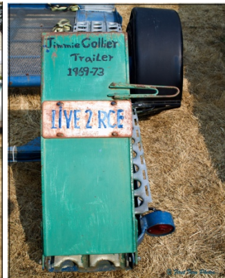
Jimmie Collier's trailer.