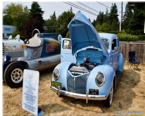
Warren Kindle's Beautiful 39 Ford Deluxe.