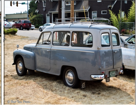
An elderly Volvo 455 Duett.