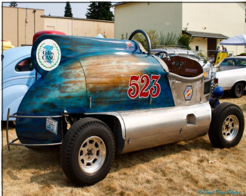
#523 has made several shows.