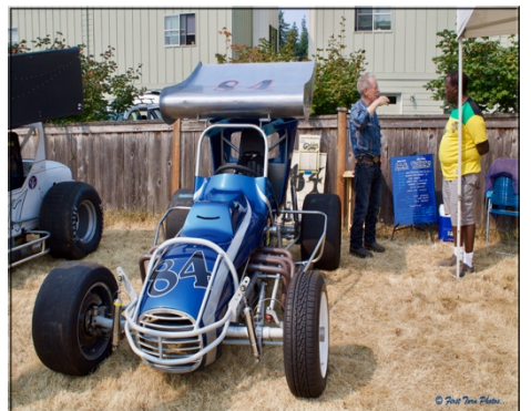
Loren Day's #84 Modified