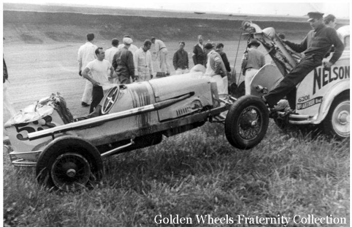
Golden Wheels Fraternity Collection