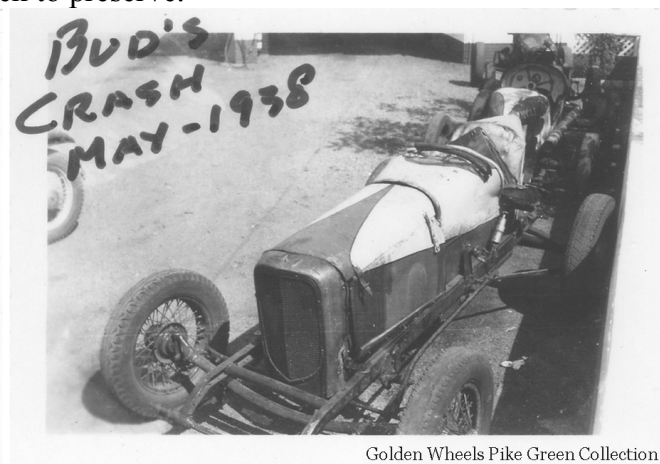
Golden Wheels Pike Green Collection