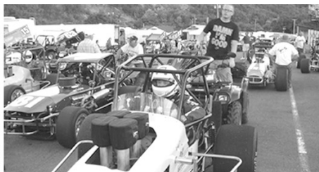
Line-up for the Sprints and Modifieds.