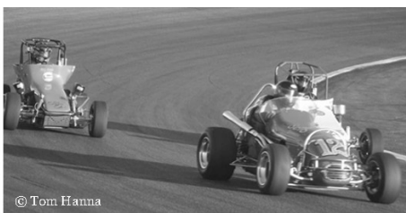
The "Old Pro" shows the way