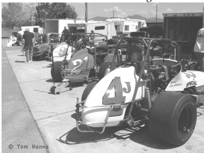
A small part of pit row at Stateline Speedway.