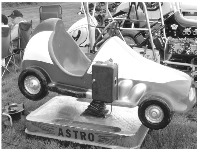
Several drivers stated a desire to shoe this in 2012

Our thanks again to Sandblaster's and The Plant Farm, for providing the sponsorship and great location for our Annual Inspection and Car Show.