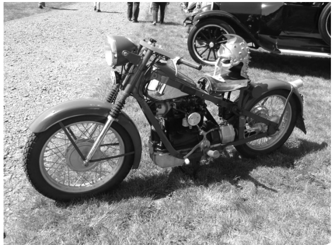
And the "Guest's Hot Ride"

And a couple of more very nice cars on display.