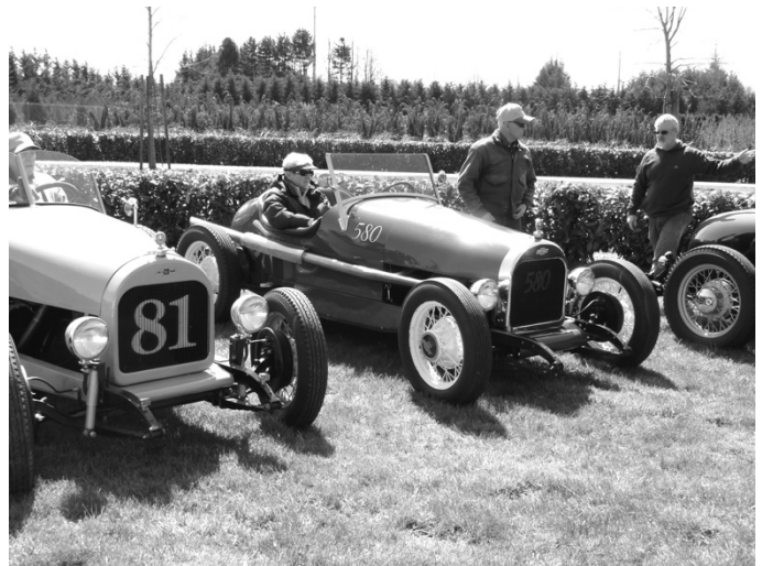
Some of the visiting Speedsters