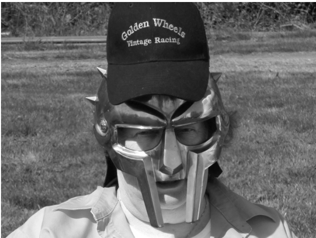
Our "Mystery Guest"??