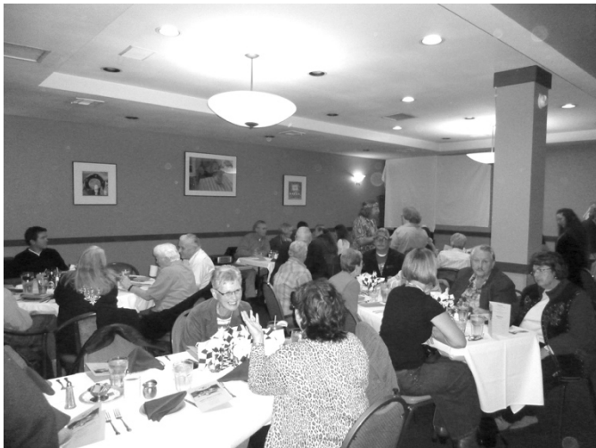
Some of the 2010 Banquet crowd enjoying the night.